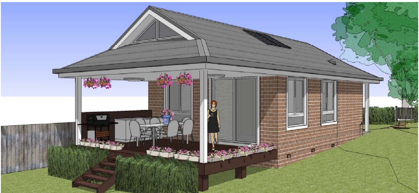
REAR YARD PERSPECTIVE VIEW