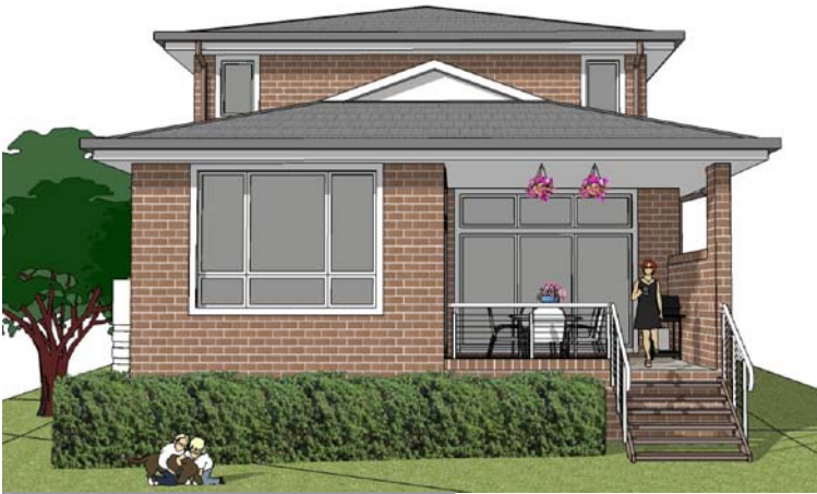
REAR YARD VIEW