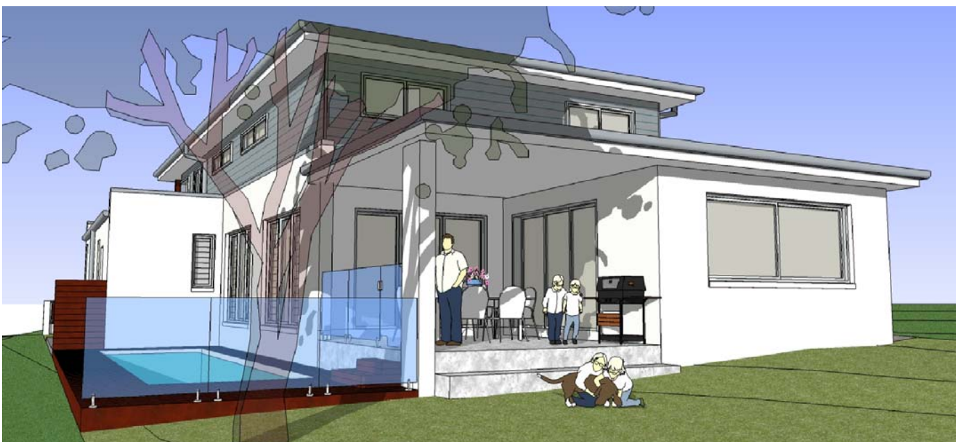
REAR YARD PERSPECTIVE